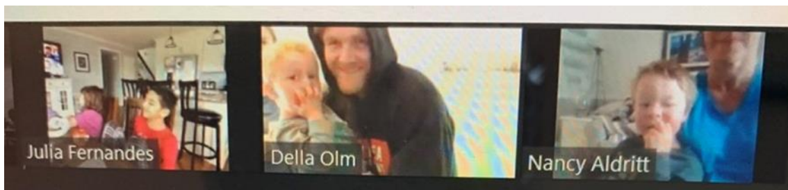
Sunday School on Zoom