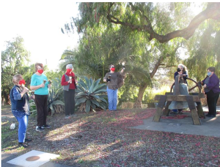
Ringling bells in remembrance of 40,000 Americans killed by COVID 19