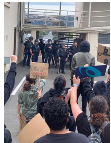
Black Lives Matter peaceful demonstration

Your love and compassion have proven these trying times do not lessen, but rather strengthen our resolve to serve to the mission of our church and our wider community. Thank you for giving from your heart.