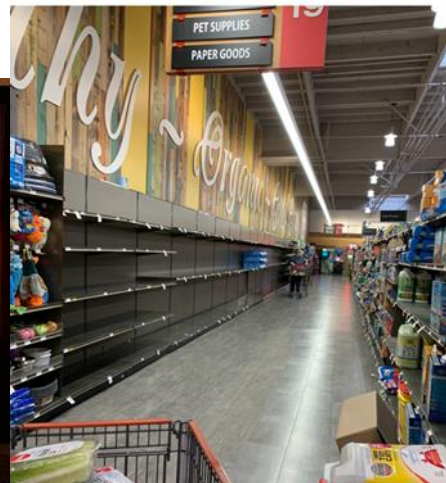
Fires, fear and hoarding of toilet paper