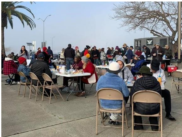
Feeding our Friends on the Street (pre-COVID)