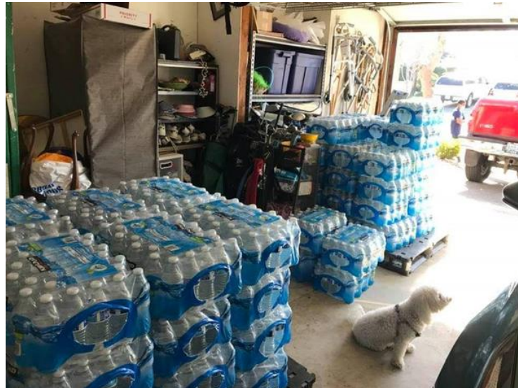
Collecting water for Friends on the Street