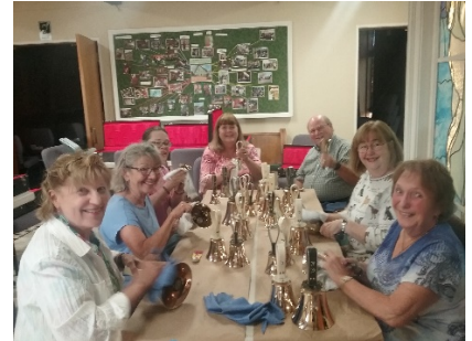
Cleaning the bells