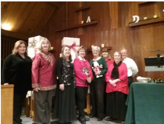
Rolling Tones 2019