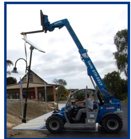
Installation of solar lights