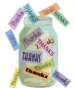
Overflowing With Thanks

A greenhorn with no foundation or understanding of the inner workings of a church, very little leadership experience and quite honestly, a real lack in financial experience, I was literally shaking, during our first committee meeting. I voiced many doubts and uncertainties but I was graced with the best team a newbie could have. I was a legal secretary after all, not a financial/fundraising genius. Again, a surprise gift emerged.