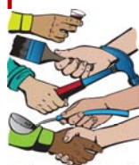
Friends in Deed

A devoted committee, witnessing the surprising power of Tootsie Rolls and trying to discover the heartbeat of our church - gifts such as these are blessed, and rare. I consider myself so very honored to have been gifted the opportunity to serve you and our church as Steward these last two years.