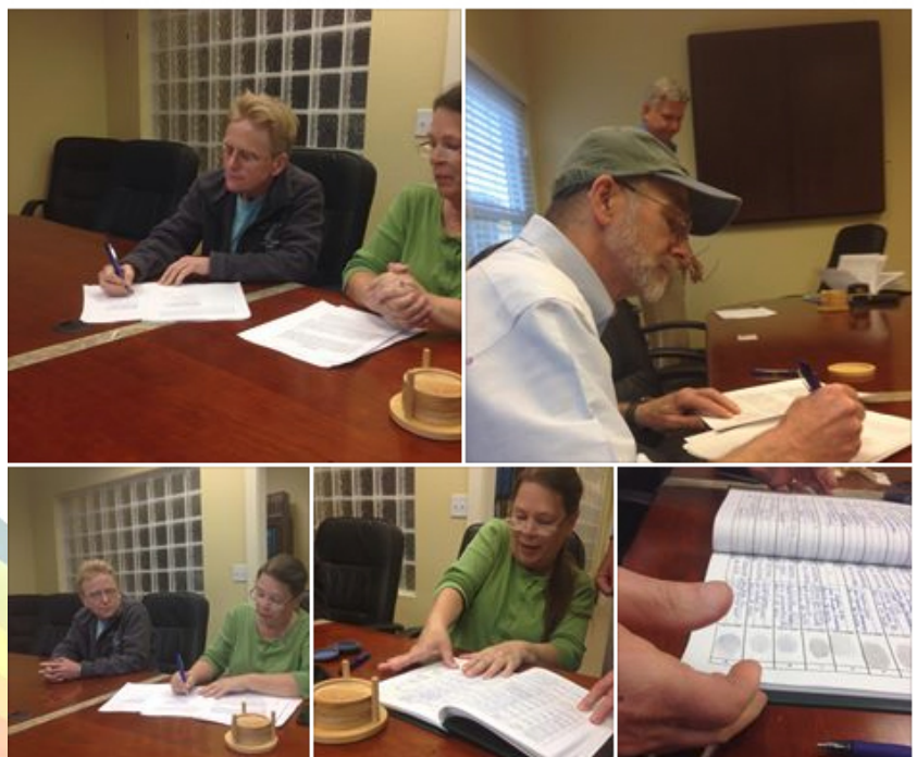
Loan signing and thumb prints! Moving forward on parking lot.

The Committee meets every other Sunday at 11:30 in the CE room.